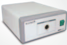
NTSC 525 LINES